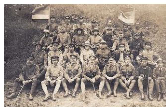
Image: Collection of John Sheen author of histories of the Northumberland Fusiliers and Durham Light Infantry.

Although they didn't bear arms, many died. War Office figures from 1920 give a grand total of 17,419 deaths; 2,218 in France, 500 in East Africa, 11,624 in Mesopotamia, 23 in Dunsterforce, 670 in Persia, 555 in Egypt, 127 in Gallipoli, 9 in Muscat and Aden and 1,621 on the