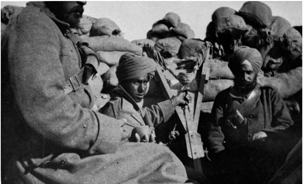
Troops of the 29 th Indian Infantry Brigade in the trenches of Gallipoli, 1915

http://www.nam.ac.uk/microsites/ww1/videos/empire-commonwealth-gallipoli/#.WDgTNmd76H8