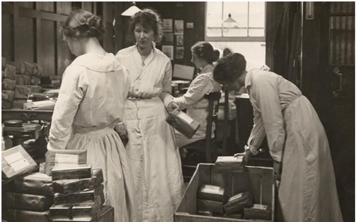
'Cadbury girls' build care packages for troops