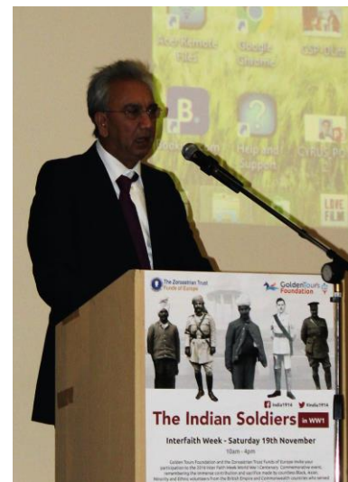
Lord Dolar Popat

'Take up our quarrel with the foe: To you from failing hands we throw, The torch; be yours to hold it high.