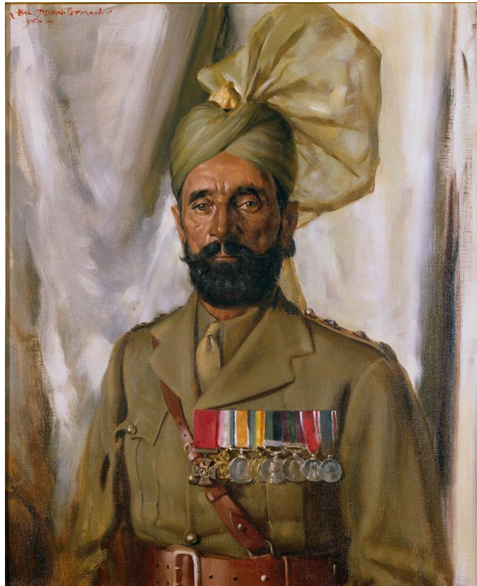
Subadar Khudadad Khan VC 10 th Baluch Regiment, c1935 [National Army Museum Archive]

[National Army Museum Video Series – First World War in Focus]