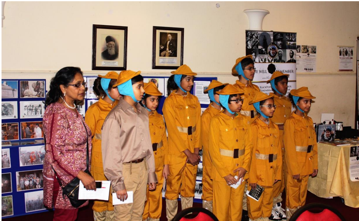
The Sai School children youth's group for India 1914

The Sai School of Harrow was launched in 1995 as a multi-faith and human rights program. The Sai citizens program was started in 2004 to match each children's group to a local charity and the British Legion in South Harrow was one of the first projects; children took on the sale of poppies.