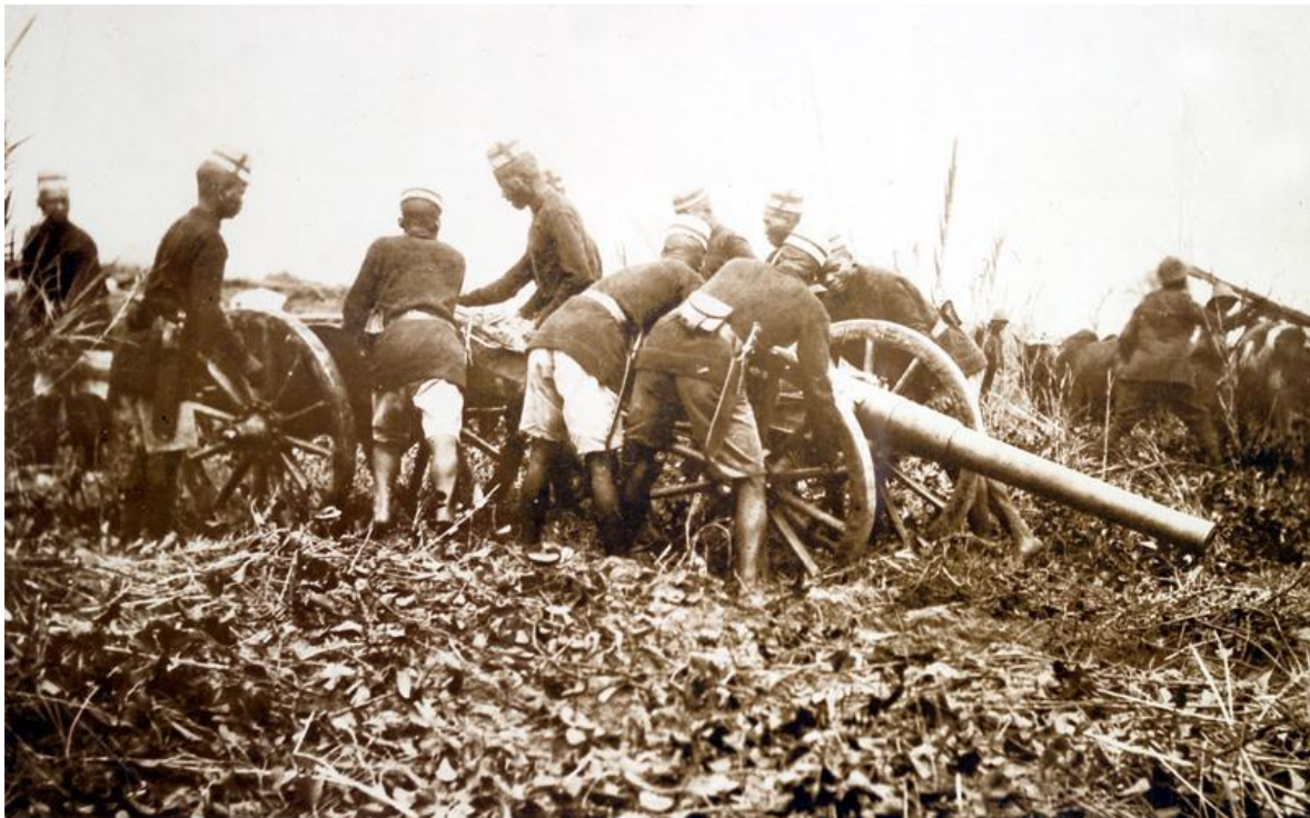
Askaris moving a field gun into position

http://www.nam.ac.uk/microsites/ww1/videos/empire-commonwealth-east-africa/#.WDgRbWd76H8