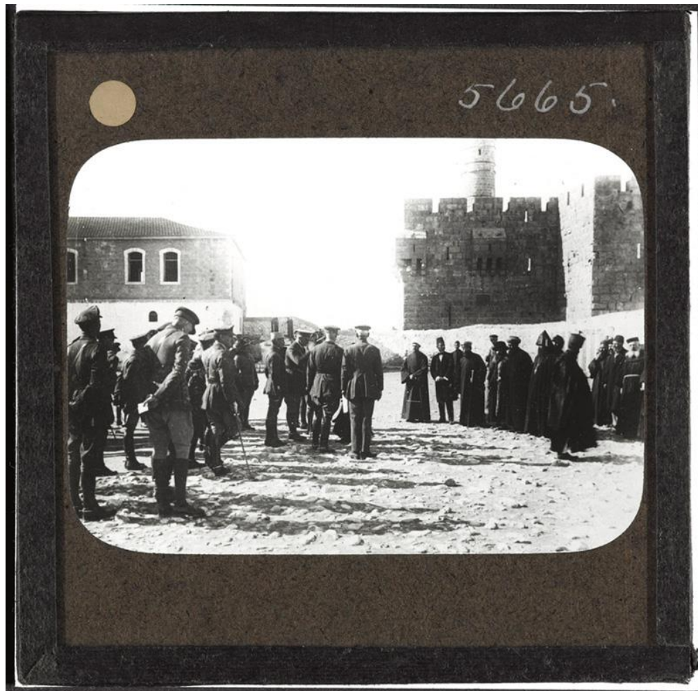
General Sir Edmund Allenby in Jerusalem, 1917 [National Army Museum Archive]

http://www.nam.ac.uk/microsites/ww1/videos/empire-commonwealth-palestine/#.WDqTgGd76H8