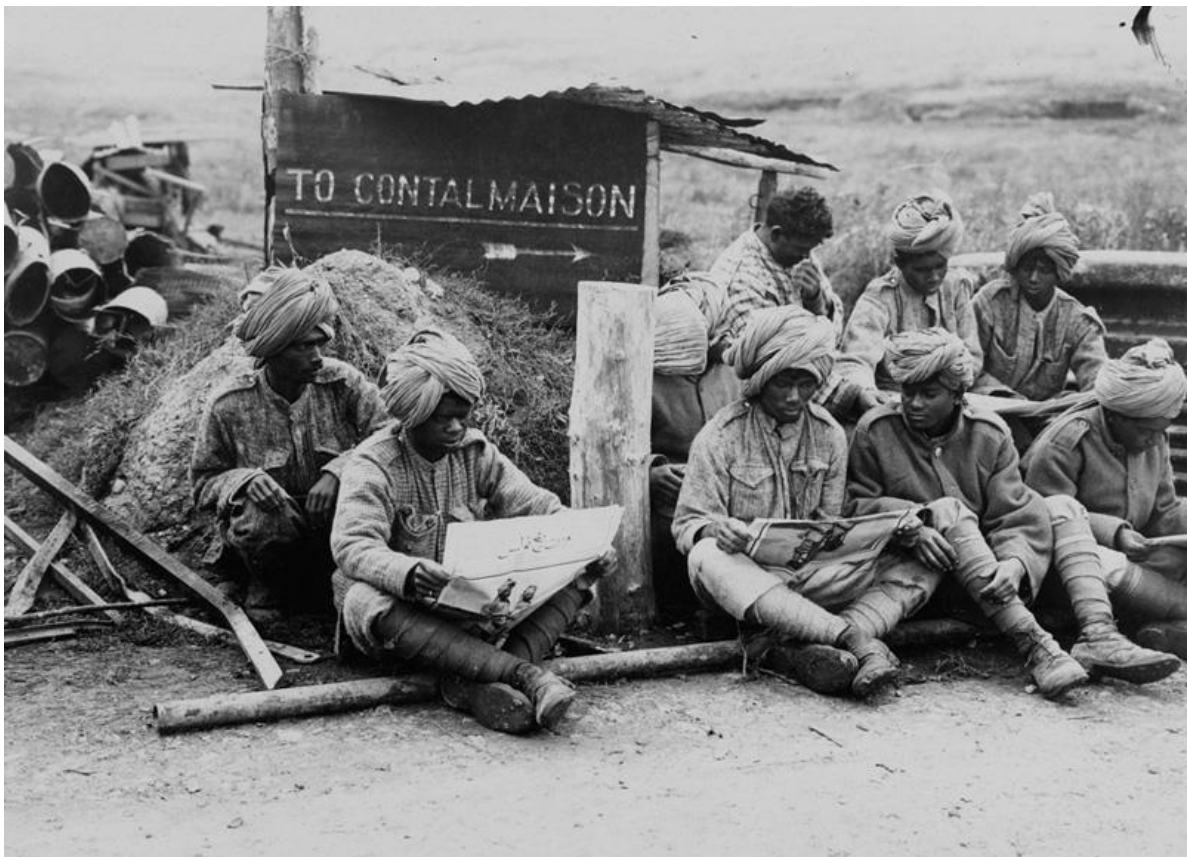
Members of an Indian Labour Battalion reading papers during a work break, c1917 [National Army Museum Archive]

http://www.nam.ac.uk/microsites/ww1/videos/empire-commonwealth-western-front/#.WDgM6md76H8